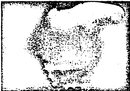
The UFO about to pass behind a nearby tree . . .