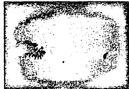
. . . and moving off into the distance.

In IUR, Vol. 2, No. 11, the Foreign Forum feature mentioned a case wherein a Guatemalan camera crew videotaping a car commercial turned