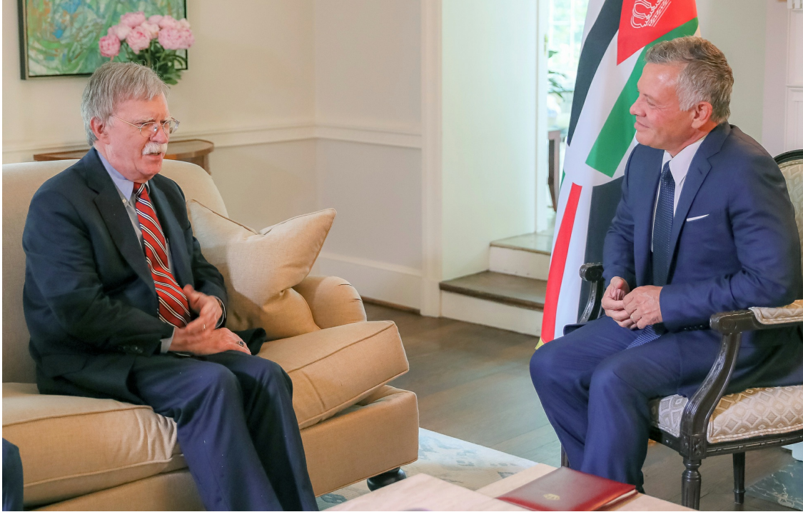
I met with King Abdullah at the residence of Jordan's Ambassador to Washington on June 22, 2018, just before the King's meeting with Trump to discuss the continuing crisis in Syria, and Iran's support for the Assad regime.