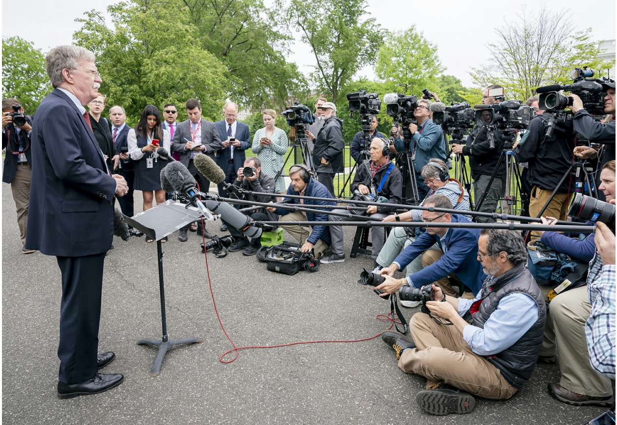
After a sad day for the people of Venezuela, I explained to the press outside the West Wing on May 1, 2019, how close the opposition to the Maduro regime had had come to ousting him.