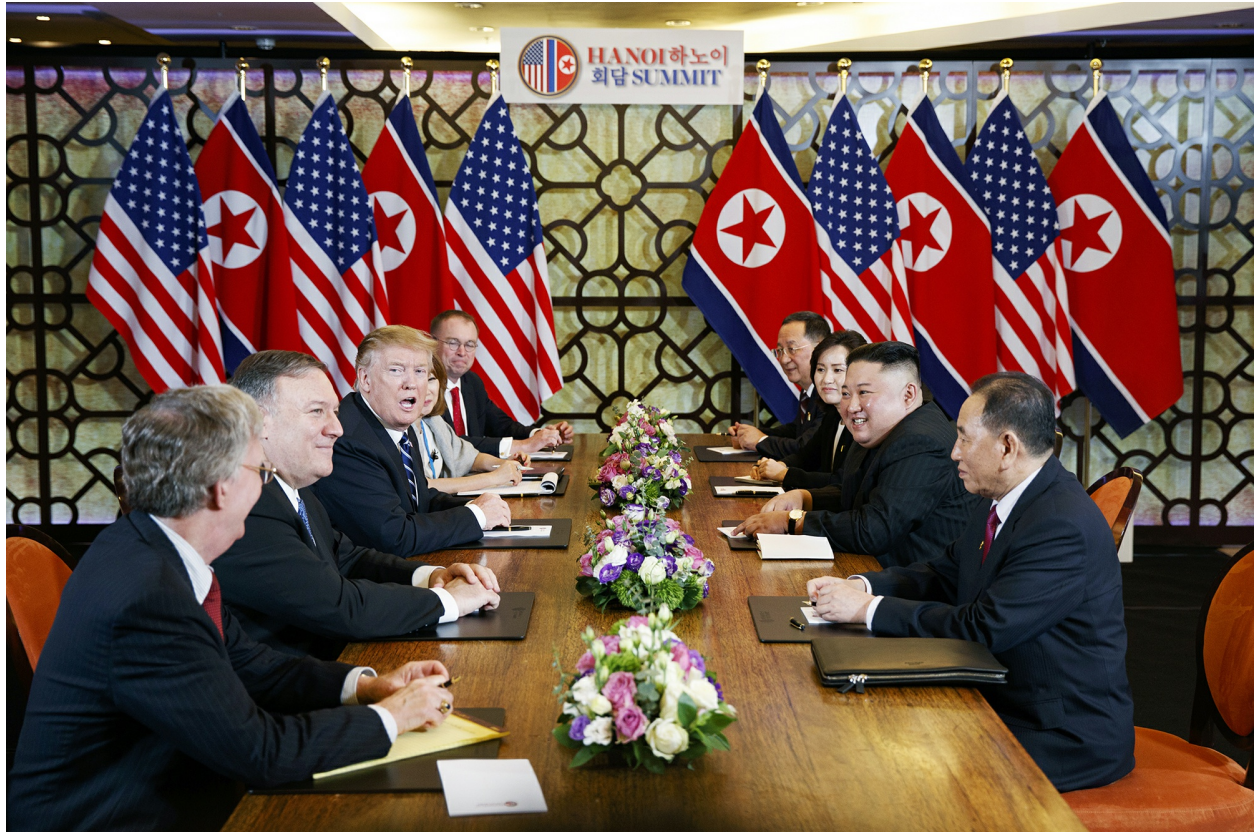
The final meeting of the Hanoi Summit between the United States and North Korea, February 28, 2019, from which Trump walked away without a deal.