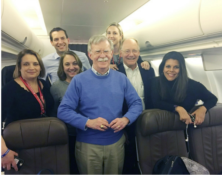
Always an experience: reporters accompanying me on one of several Middle East trips on board our military aircraft, March 23, 2019.