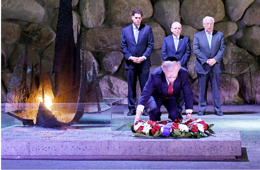
Laying a wreath at the Yad Vashem Holocaust memorial in Jerusalem, Israel, on August 21, 2018, a traditional stop for high-level visitors.