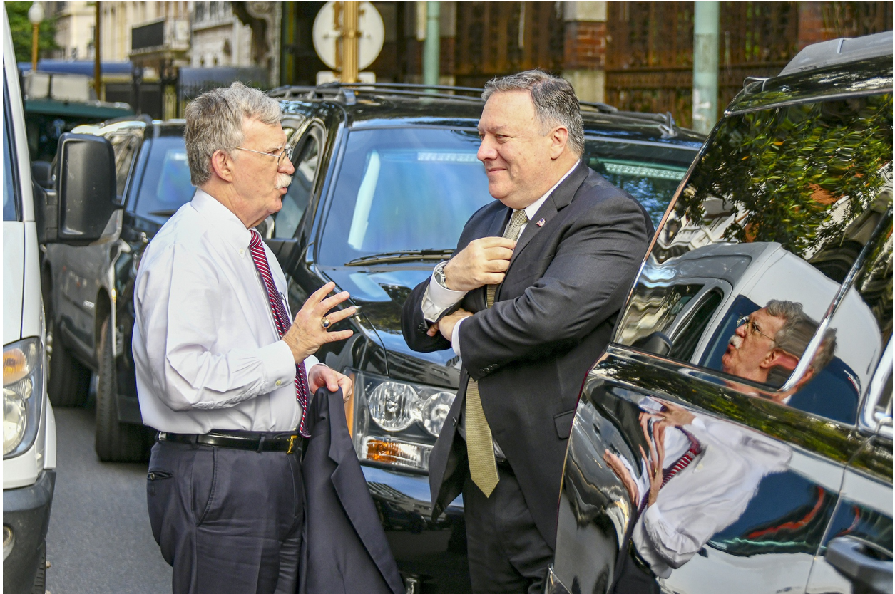
Pompeo and I speak while waiting for Trump, typically late, to join the G20 meetings in Buenos Aires, Argentina, on November 30, 2018, as relations with Russia chilled after the seizure of Ukrainian ships in the Kerch Strait.