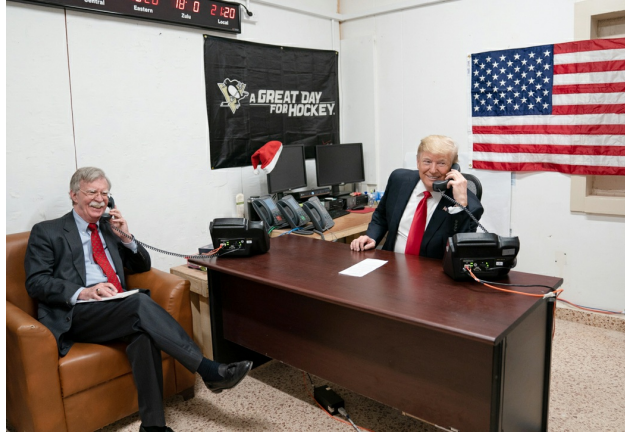
Trump speaks by phone with Iraqi Prime Minister Adil Abdul-Mahdi from Al-Asad air base in Iraq on December 26, 2018, after Abdul-Mahdi decided not to meet with Trump at the base.