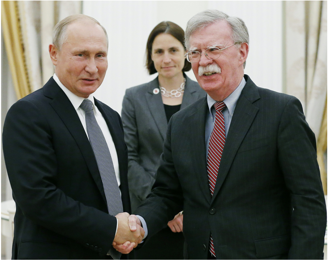
Russian President Vladimir Putin welcomes me to our second 2018 meeting in Moscow's Kremlin, on October 23, where, among other things, Putin joked that Russia would sell weapons to Saudi Arabia if the US did not. Fiona Hill, NSC Senior Director for Europe and Russia, looks on.