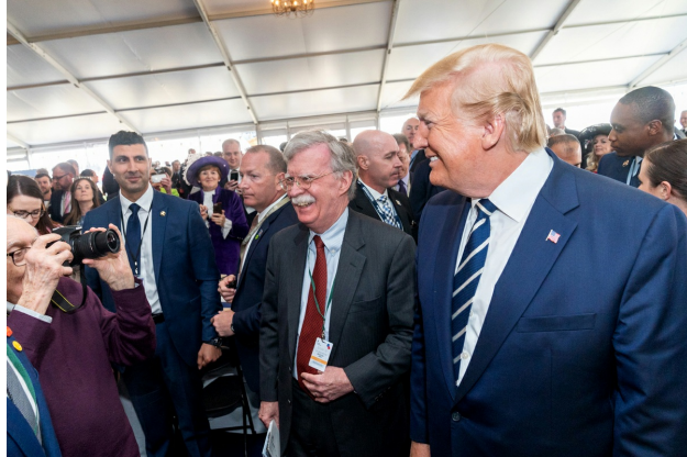
Trump meets with US service members, veterans, and their families at the UK celebration of the 75th anniversary of launching D-Day, on June 5, 2019, at Portsmouth, England, from which much of the Allied invasion armada sailed.