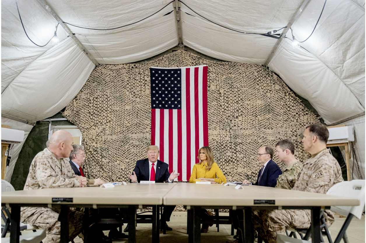
One of the turning points in Trump's decision making on Syria: being briefed by American military commanders at the Al-Asad air base in Iraq, December 26, 2018.