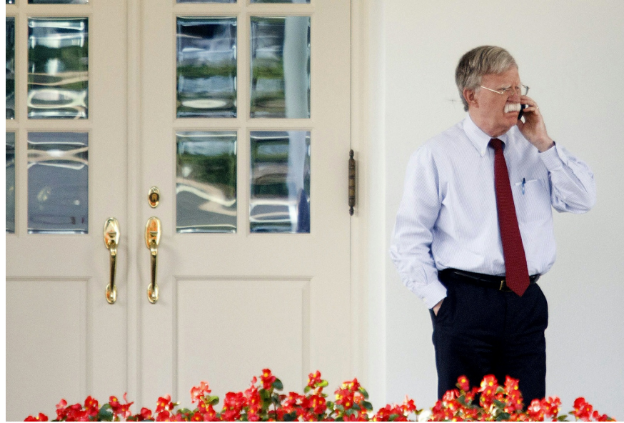
Outside the West Wing on September 10, 2019, explaining to my daughter on my personal cell (normally kept in a secure box during the work day) that I am about to resign.