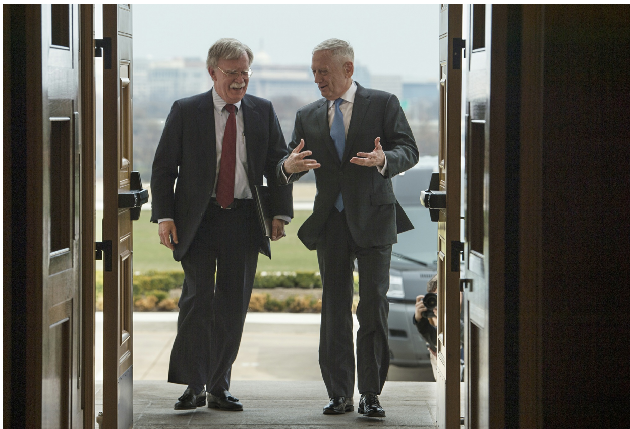
After greeting me at the Pentagon's ceremonial entrance, Mattis and I enter the building for our first meeting, on March 29, 2018, ten days before my official start as National Security Advisor.