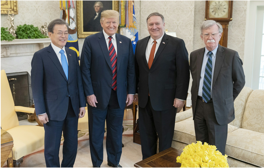
Trump's meeting with South Korean President Moon Jae-in, April 11, 2019, considered what to do next about North Korea's nuclear weapons and ballistic missile programs after two failed summits with Kim Jong-un.