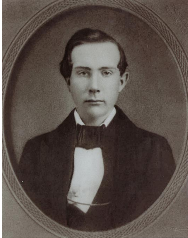
John D. Rockefeller

As a portrait artist, I couldn't help sharing that early photo of Rockefeller, Sr. I suggest you study it closely. There looks to be something very wrong with that young man, something we haven't been told. He looks to me like a mental patient. I am reminded of the pictures of Walt Whitman we looked at in my paper on him, which struck me the same way. It crossed my mind that perhaps they have substituted pictures of mental patients for these famous people, to see if any of us would notice. If I am the first, please send me the prize.