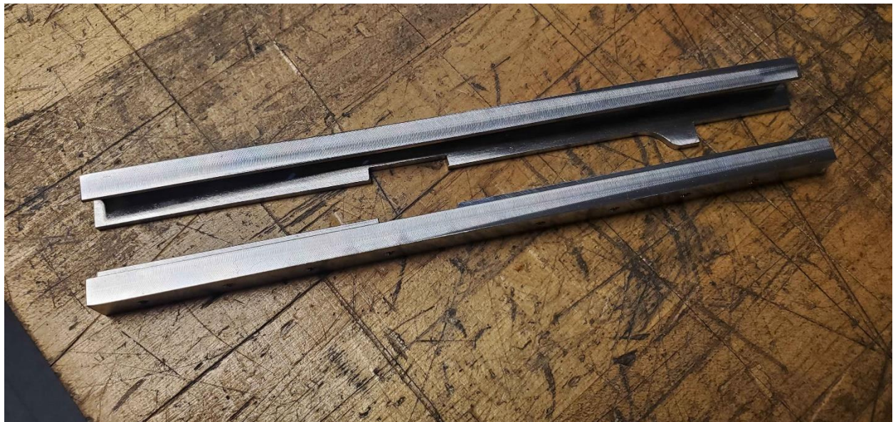
Example of milled spec Plastikov rails

At the time of publication, both avesrails.com and riptiderails.com are offering Plastikov rails for sale (or are getting ready to offer them). I have personally tested their rail offerings and can confirm they worked great for me. They are both offered with the required screws.