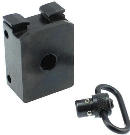
Generic Pistol Rear Trunnion

While other generic pistol trunnions should work, I cannot guarantee they will. The AK-Builder rear trunnion fits snug and works properly.