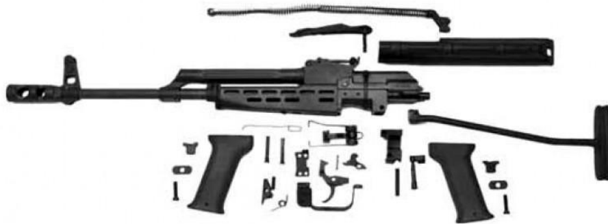
Example of useable AKM Parts kit

The link to AOA's headspaced kits: https://armsofamerica.com/shop-all/headspaced-kits/