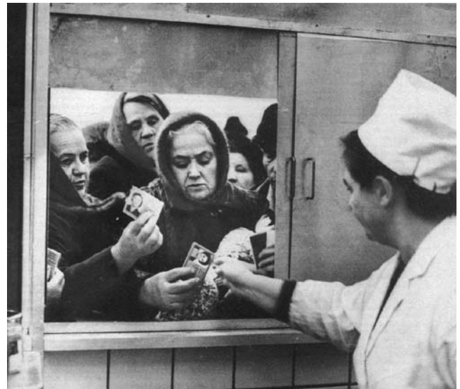
Soviet women show ration cards to buy food.