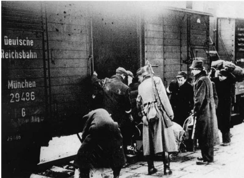
Archives of Mechanical Documentation, courtesy of USHMM Photo Archives