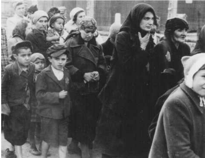
Hungarian Jews on their way to the gas chambers. Auschwitz-Birkenau, Poland, May 1944.