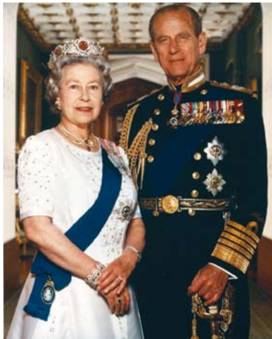
Official portrait taken at Buckingham Palace, Her Majesty Queen Elizabeth II and His Royal Highness Prince Philip, the Duke of Edinburgh.

His father taught his boy how to follow his masters very well under the Nazi occupation in Hungary: "The most rational approach, in my view, was complete separation, followed by a quiet effort to blend in with the general population. That is the way animals do it: when they sense danger, instead of